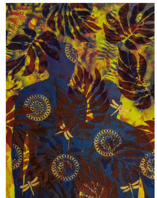
Night Garden: In the Moonlight the Stars Chatter by Morel Doucet