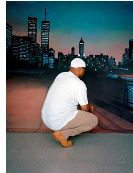
The Visiting Room #4 , Digital Archival Print, 2019

Larry Cook, Photographer and Educator, will collaborate with formerly incarcerated photographers to share their stories and craft through traditional studio portraiture.