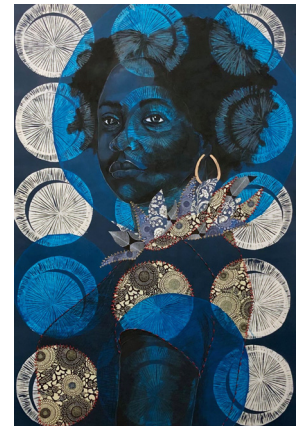
Night Bird , 2020 Relief printing, Charcoal, Acrylic, Liquid gold leaf, Decorative papers, Hand stitching, 42" x 30"

Museum Collections (selected): Crystal Bridges Museum Minneapolis Institute of Art Minnesota Museum of American Art National Museum of Women in the Arts Library of Congress The Studio Museum in Harlem Petrucci Family Foundation Collection of African American Art