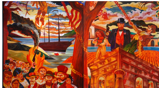
Manumissions , Oil on Canvas, 68" x 120", diptych, 2006

Painter, educator, Arvie Smith will work with Afro-Italian incarcerated youth. Participants will learn approaches to pencil and figure drawing. Skills in drawing equip the artist with the means of communication in the universal language of art.