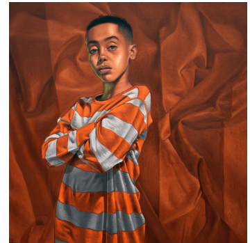
Jacob, 2020 Oil on Canvas, 36" x 36"

Museum Collection: Petrucci Family Foundation Collection of African American Art