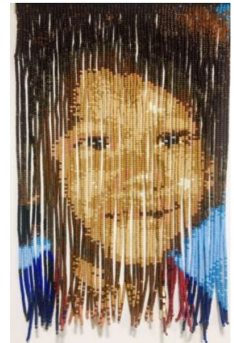
Stolen Moments , 2019-2020 Hair beads on coated wire and Aluminum rod 39" x 24" x 1"

Museum Collections (selected): Aspen Museum of Art Petrucci Family Foundation Collection of African-American Art Smith Robertson Museum Studio Museum of Harlem