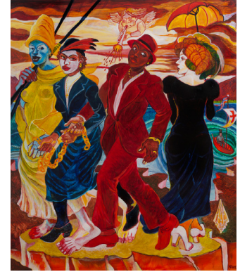
2Up and 2Back , 2019 Oil on Canvas, 72" x 60"

Museum Collections (selected): Delaware Museum of Art Hallie Ford Museum of Art Petrucci Family Foundation Collection of African-American Art Portland Art Museum Reginald F. Lewis Museum