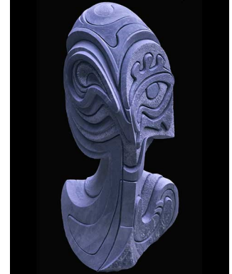
High John the Conqueror , 2009 Bardiglio Nuvolato Marble, 54" x 20" x 20"

Museum Collections: The Hampton University Museum The Schomburg Center Research in Black Culture Embassy of Oslo Norway, Arts in Embassies Program