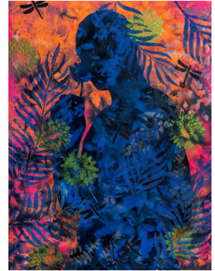
Stop and smell the roses (Black bodies stain the pavement in crimson red), 2020, Acrylic on wood, Mylar, Aerosol paint, Flora and Fauna, 40" x 30"

Museum Collections (selected): Pérez Art Museum Miami (PAMM) UK Contemporary Art Society, Plymouth Box Museum Petrucci Family Foundation Collection of African American Art