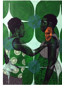
New Beginnings , Acrylic, Relief printing, Lithography, Charcoal, Decorative papers, Hand-stitching, 54" x 74", 2017