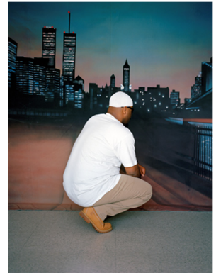
The Visiting Room, #2, 2019 Digital Print, 40" x 30"

Museum Collections: Baltimore Museum of Art (promised gift) Museum of Modern Art Harvard Art Museums