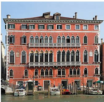
Palazzo Bembo, Venice, Italy

The ECC-Italy will present Personal Structures in three Venetian palazzos and two gardens. The Afro-Futurist Manifesto: Blackness Reimagined will be held in Palazzo Bembo. The event is free and runs from April – November 2022, and expects to draw over 600,000 visitors from around the world.